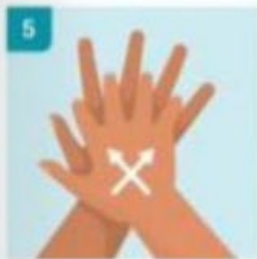
SCRUB BETWEEN YOUR FINGERS