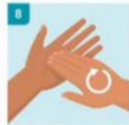
WASH FINGERNAILS AND FINGERTIPS