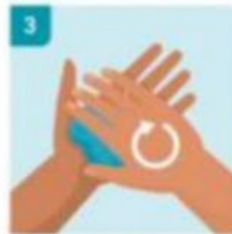
RUB HANDS PALM TO PALM