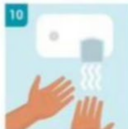
DRY WITH HAND DRYER