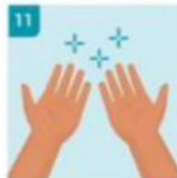
YOUR HANDS ARE CLEAN !