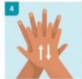
LATHER THE BACKS OF YOUR HANDS